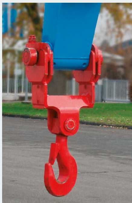
Load hook TLH 150 / Load hook TLH 160